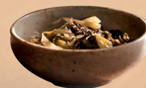
R16 Pickled Vegetable